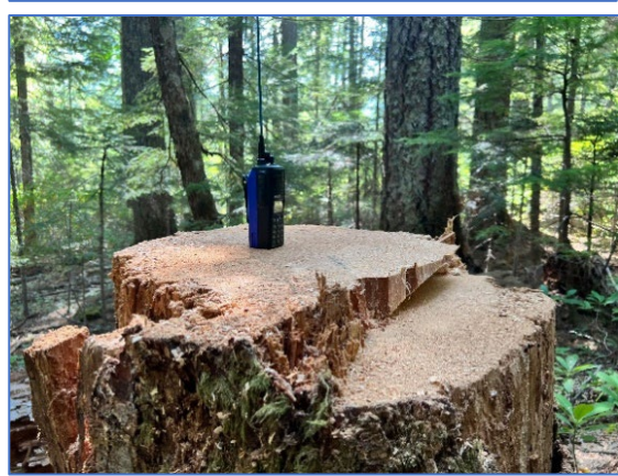
The hazard tree and its stump.

When it came time to execute the sloping cut, an error occurred. The sawyer inadvertently mismatched the two cuts that form the undercut by only using the kerf that was visible to align their cuts. This error left a nearly 3-inch bypass on the tree's offside that was obscured from sight. This bypass would ultimately change the direction of the tree's lay and disrupt the orientation of the back cut.