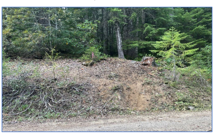
This is the route where the handline was to be constructed to cut off the dogleg near Forest Service Road 705.

The crew member who would be operating the chainsaw had been working for three fire seasons and had shown proficiency at their current certification level. They were on track to become certified as a FAL2 (Faller 2, Intermediate Faller). Their task involved felling a 30-foot-tall snag with obvious signs of rot that was located near where the handline would be constructed.