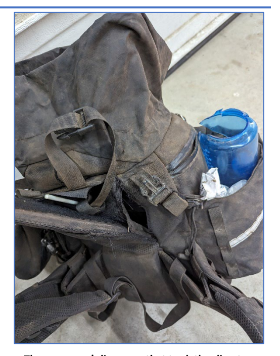
The swamper's line gear that took the direct hit—on the swamper's back—from the 30-foot tall falling snag. Notice how the line gear's hard plastic yoke was blown apart and the hard plastic water bottle was shattered.

During the briefing, several hazard trees were discussed. It was determined that these trees needed to be felled before the crew could proceed with their assignment. Two members of the Type 2 IA cohesion crew, who were certified as FAL3 (Faller 3, Basic Faller), were selected for the felling assignment. The intention was to provide them with training and proficiency opportunities. Therefore, both individuals were at the base of the snag, one as a mentor and the other a student.