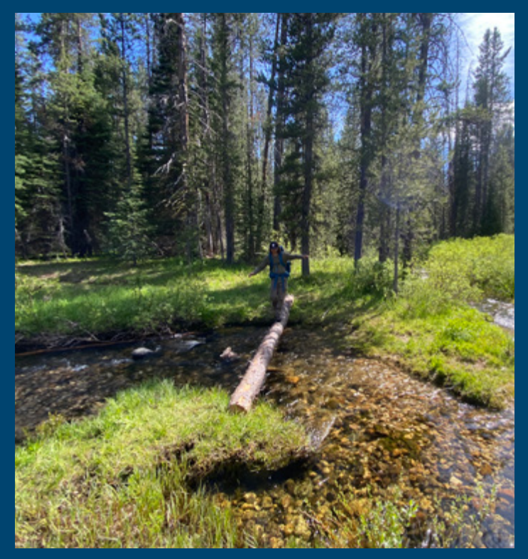
Crossing Boundary Creek on the Camptender Trail