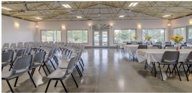
The Spring House

Squaw Butte's end of season Potluck will be held on Saturday November 19, 2022, 4:00 pm to 8:00 pm and sitting down to dinner at 5:00 pm. Members should bring dishes to share and beef brisket will be provided. Tea, coffee, and soft drinks will be available, 'BYOB'. We will be doing a food and funds drive for the Idaho Food Bank. Each person will get a raffle ticket upon arrival and drawings will be throughout the evening. Guests (possible future members) are welcome (Please RSVP party@sbbchidaho.org ) so we know how many to plan on attending.