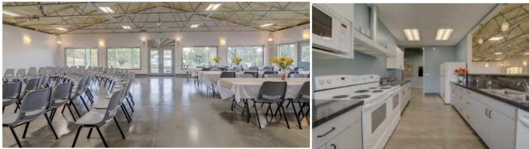
The Spring House

Squaw Butte's end of season Potluck will be held on Saturday November 13, 2021, starting at 16:00 (4pm) to 20:00 (8pm). Members should bring dishes to share, and the chapter will be providing ham & turkey. Tea, coffee, and soft drinks will be available, 'BYOB'. We will be sitting down to dinner at 18:30 (6:30pm) We will be doing a food and funds drive for the Idaho Food Bank. Guests (possible future members) are welcome (Please RSVP party@sbbchidaho.org ) so we know how many plan on attending.