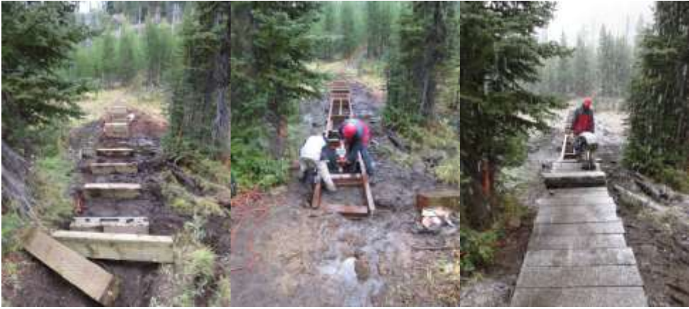
Upper causeway under construction