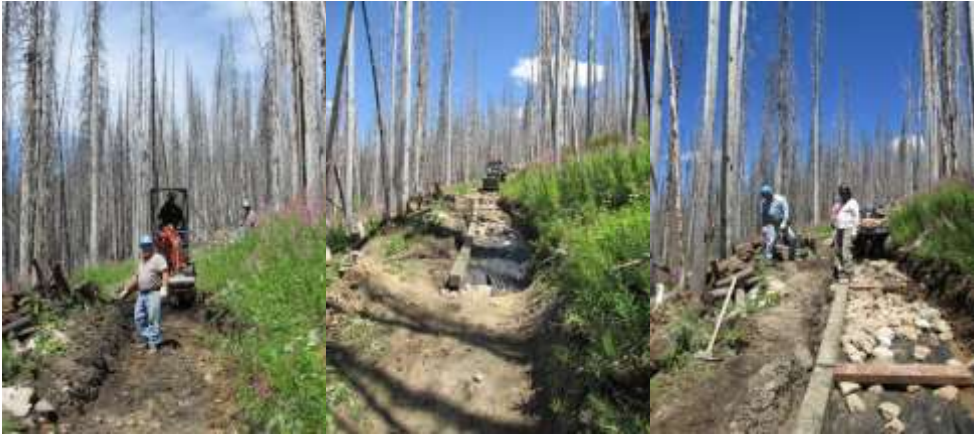
Upper Causeway Construction