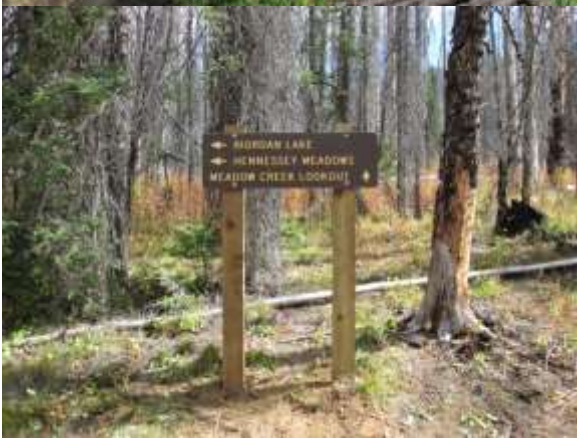
Lower causeway under construction