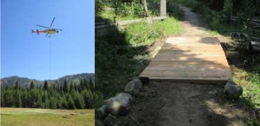
Garden Valley Helitack

We were assisted by greatly assisted by Garden Valley Helitack and the Idaho Department of Recreation Trail Ranger Program.