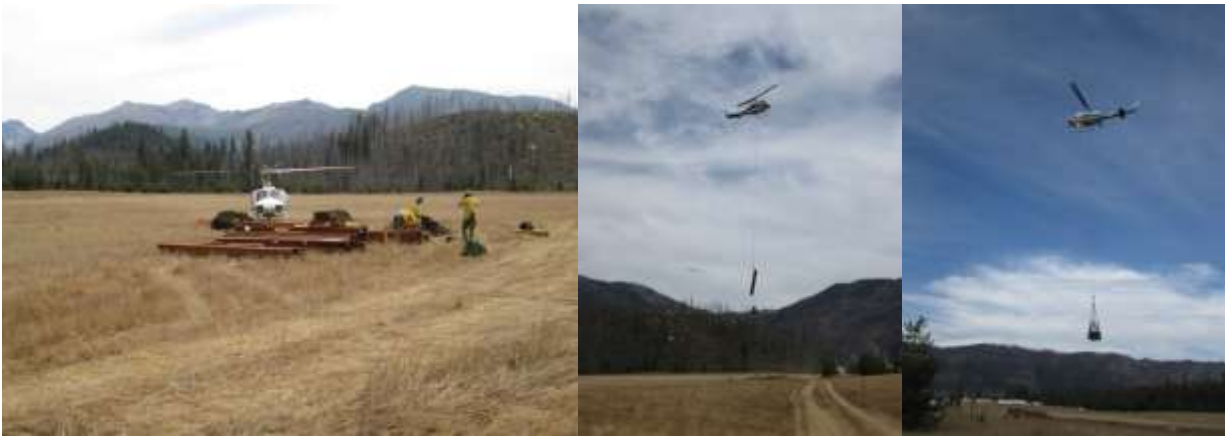
Lucky Peak delivering lumber package