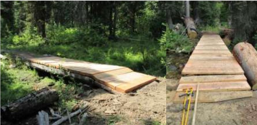
Bridge 2 completed