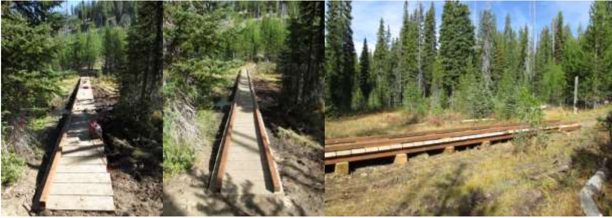
Upper causeway completed

Lower causeway currently under construction. Estimated time of completion: Mid October