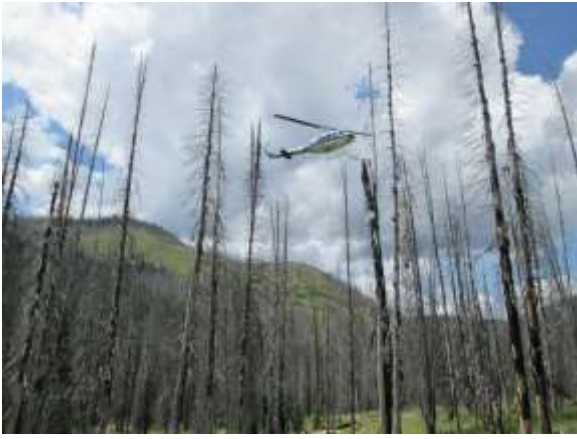
Lucky Peak delivering materials