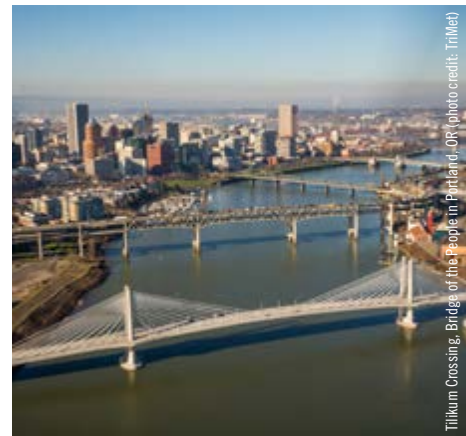
Tilikum Crossing, Bridge of the People in Portland, OR