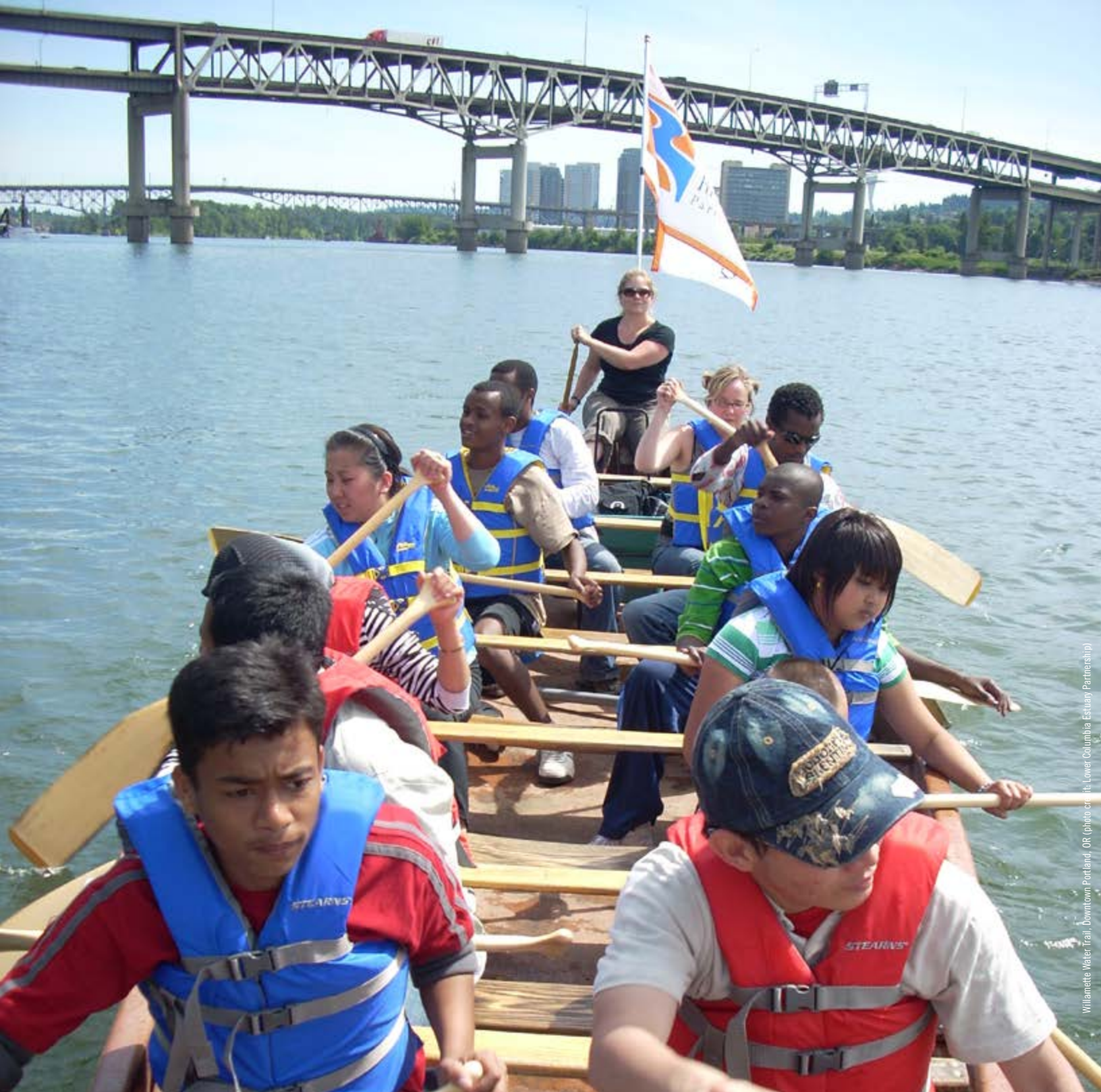
Willamette Water Trail, Downtown Portland, OR