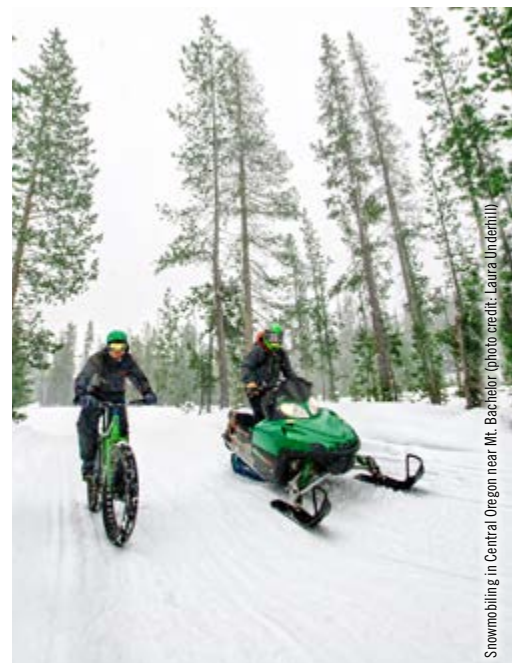
Snowmobiling in Central Oregon near Mt. Bachelor