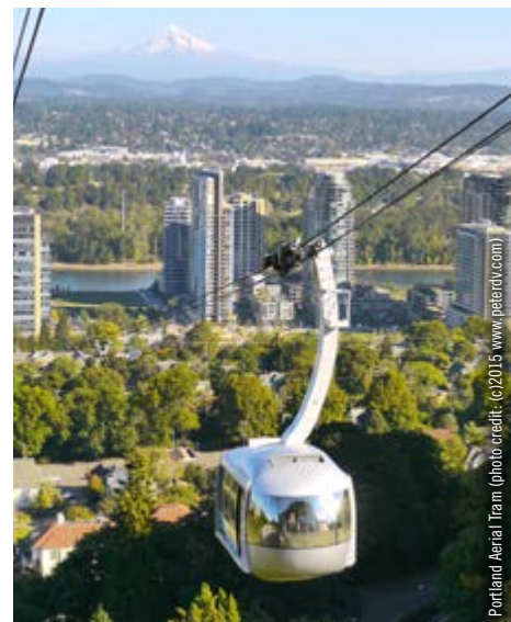
Portland Aerial Tram