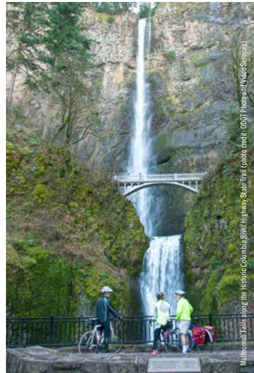
Multnomah Falls along the Historic Columbia River Highway State Trail