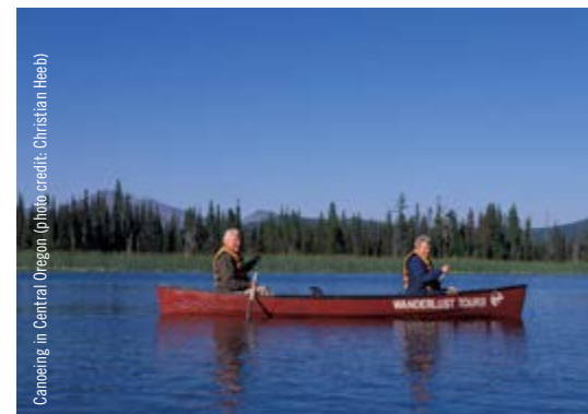
Canoeing in Central Oregon