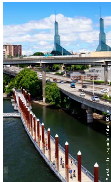
Vera Katz, Eastbank Esplanade in Portland, OR