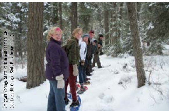
Emigrant Springs State Park in northeastern OR