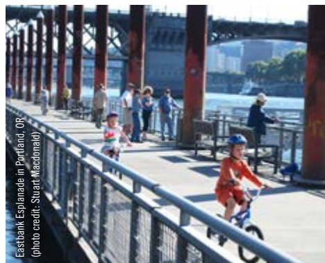
Eastbank Esplanade in Portland, OR