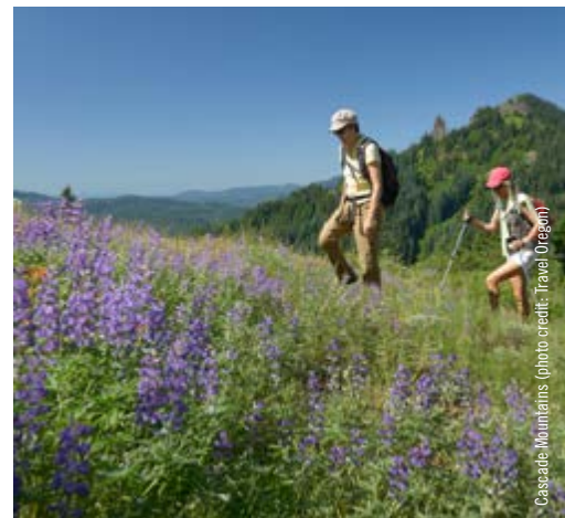
Cascade Mountains