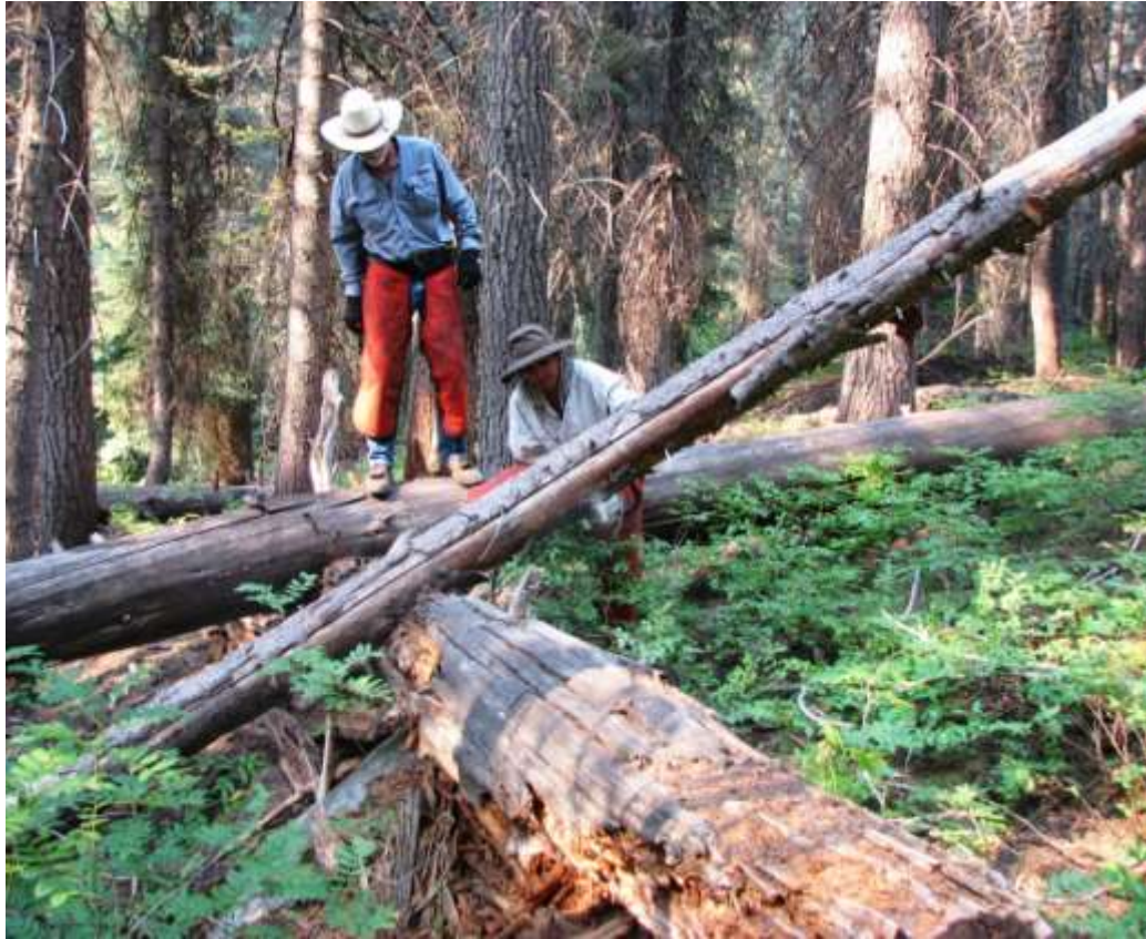
Laurie working on a widow maker while Terry acts as safety lookout.