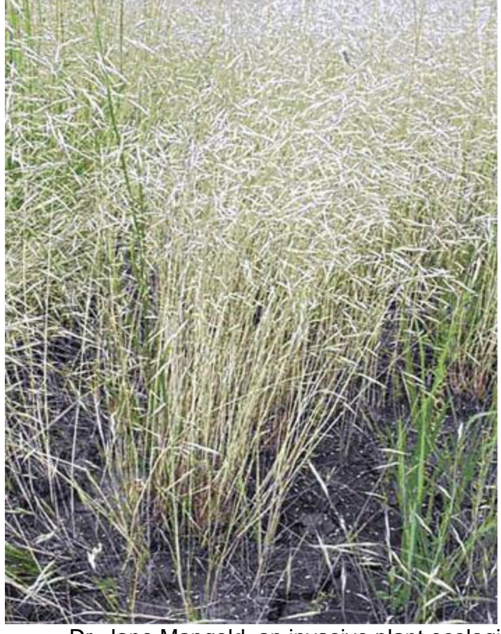
Ventenata dubia plants.