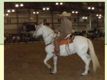
The Breed Challenge