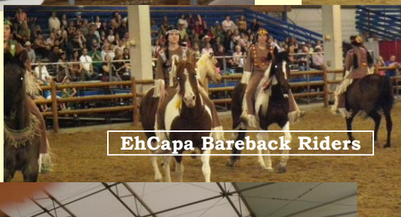
EhCapa Bareback Riders