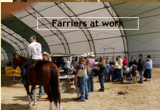
Farriers at work