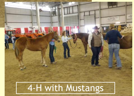
4-H with Mustangs