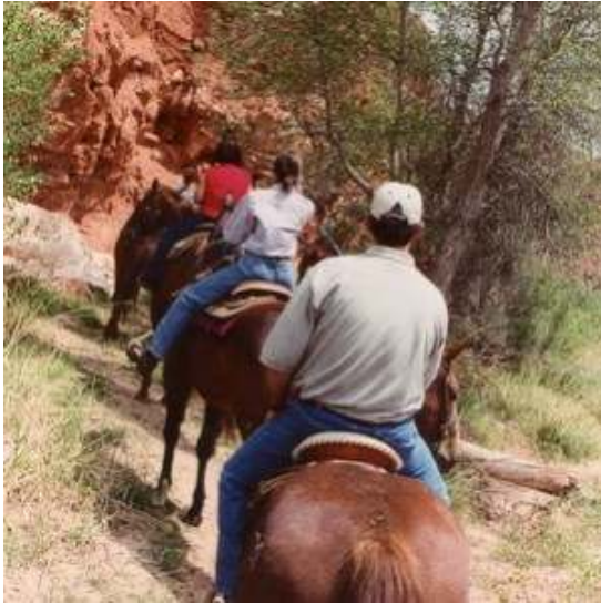
Help preserve the land you love to ride on.

Let's team up to protect the trails you and your horse love.