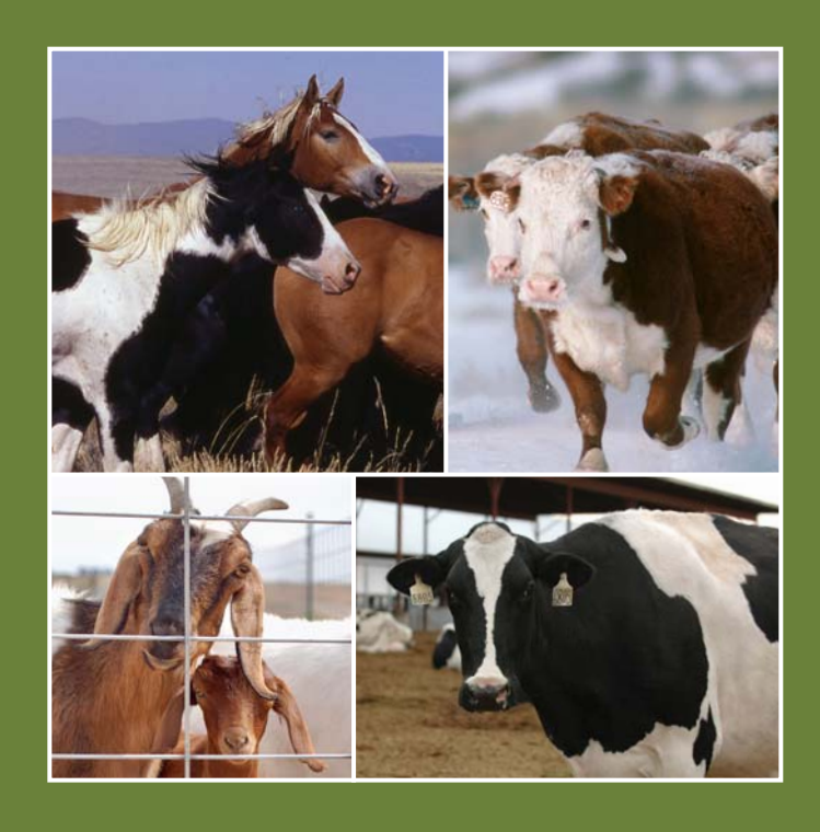
Premises Identification Protect your way of life.