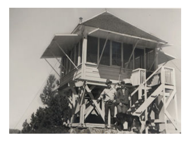
Tripod Lookout during the 1930s

"Tripod Lookout consisted of a small 10 or 12 foot square building sitting on stilts fastened by cables on outcrop of rocks at the pinnacle of Tripod Peak. Windows surround the building to provide an unrestricted 360 degree view. The furnishings consist of a small wood stove, three benches, a small table, a low cabinet which doubled as a wash basin and wate bucket stand, and a homemade double bed. I slept on the floor. Dominating the center of the room was a cabinet mounting an alidade. Oh yes, there was a had cranked telephone. This limited amount of fixtures fil the room almost to overflowing."