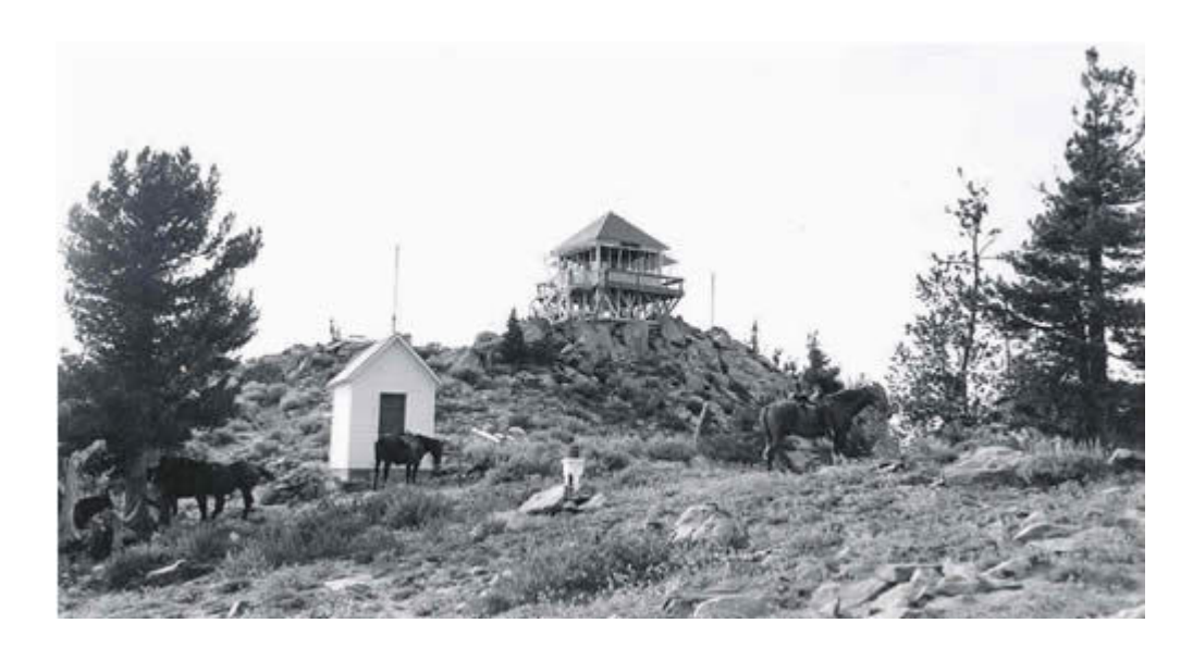
Pack string at Tripod Peak