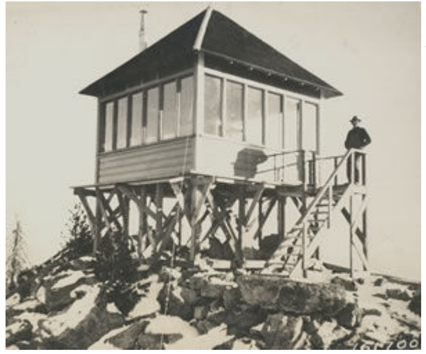
Tripod Lookout, 1921

In 1931, Tom Cherry was assigned to Tripod Lookout. In addition to fire duty, he was also responsib for "enforcing the separation of sheep and cattle ranges" and clearing trails in the area.