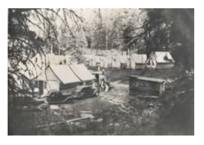
Sagehen camp, 1938