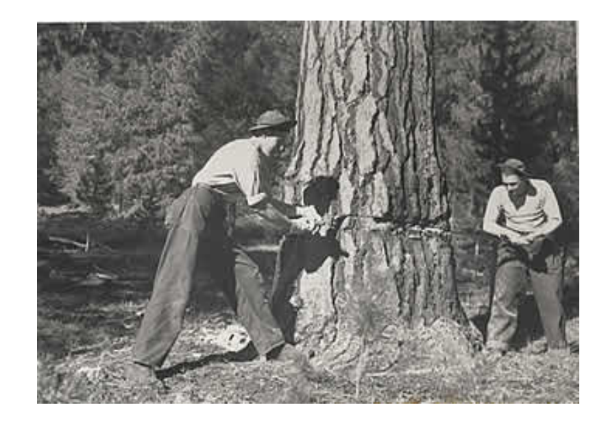
CCC boys cutting a tree by hand

The CCC enrollees spent 1937 to 1939 building a dam and reservior in Sagehen Basin. The Sagehen CCC Camp was a spike camp of the Black Canyon CCC Camp. It was a tent camp without any permanent buildings, holding about 150 CCC boys.