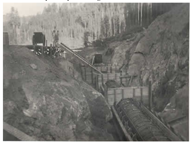
Water inlet