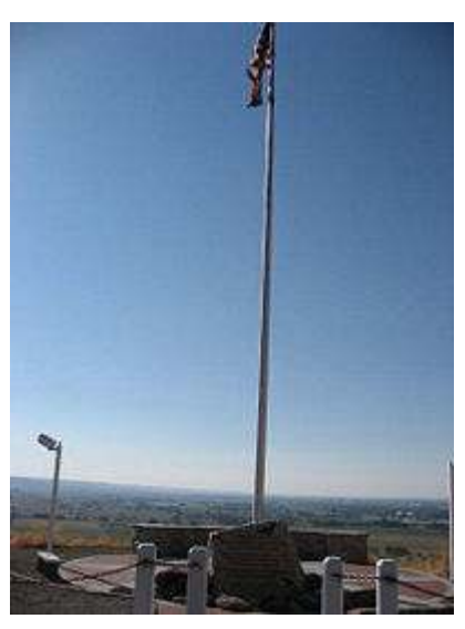
September 11 memorial at Freezeout Hill

As of the census<sup>[3]</sup> of 2000, there were 5,490 people, 2,095 households, and 1,412 families residing in the city. The population density was 3,022.5 people per square mile (1,164.7/km²). There were 2,264 housing units at an average density of 1,246.4/sq mi (480.3/km²). The racial makeup of the city was 90.60% White, 0.07% African American, 0.75% Native American, 0.44% Asian, 0.15% Pacific Islander, 5.79% from other races, and 2.20% from two or more races. Hispanic or Latino of any race were 11.57% of the population.