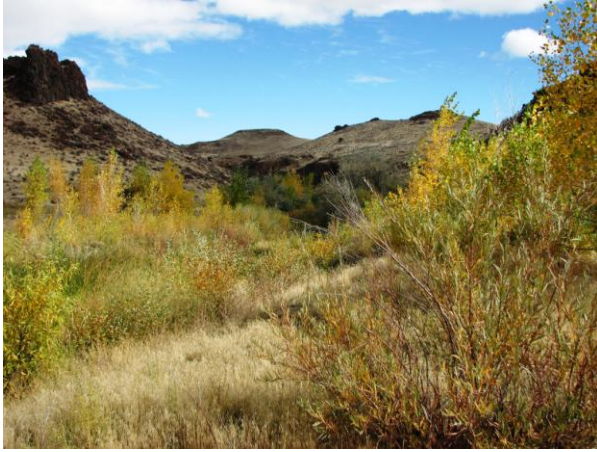
In the river canyon (up)