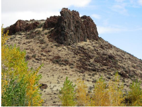
Rock out cropping, Eagles nest (up)

The eastern edge of the loop is marked by a fence and canal that you follow south to a dam where it meets the river. From there the trail swings south west and follows the river through a great canyon with interesting rock formations, caves, a huge eagle nest and pools of water where the stock can drink.