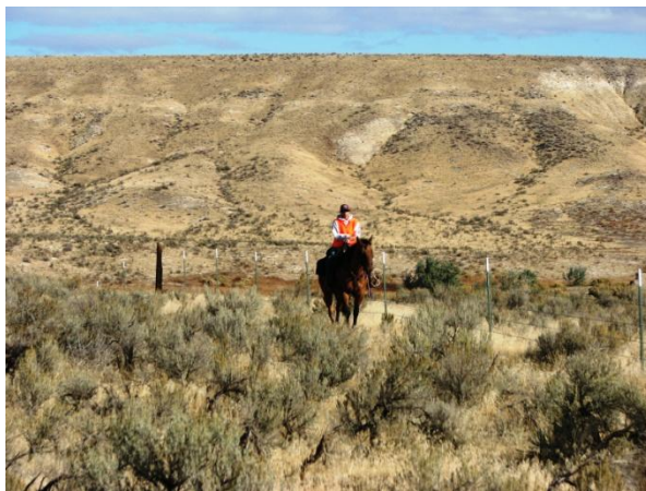
Laurie & Jack

the chapter and detailed direction to the trail head were not published, members who had signed up met at the Homedale high school and then convoyed together to a location that Laurie suggested. The trail head is a nice trailer parking area a bit south of the ranch cattle guard and just north of the power lines on the east side of the road. There is room for around twenty trailers there, and more parking if need close by. This ride would be suitable for all levers of rider experience and good year round except maybe during the hottest months. Other than some sections that cross some river rock, your horse doesn't have to be in great shape as there is very little climbing in the route. The trail follows a series of jeep type roads and traverses open spaces and a river canyon with great rock formation. In the river canyon there are a number of pools this time of year and I would expect in the spring running water in the river channel.